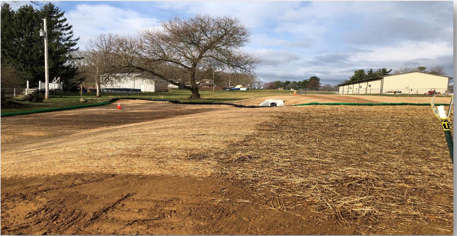
Figure 2. Completed section of graded area above the Lower Drainage Basin consistent with top dressing and seed to regain the beautiful landscape of the adjoining fields. – Again this work has been performed in accordance with the district approved NPDES permit.