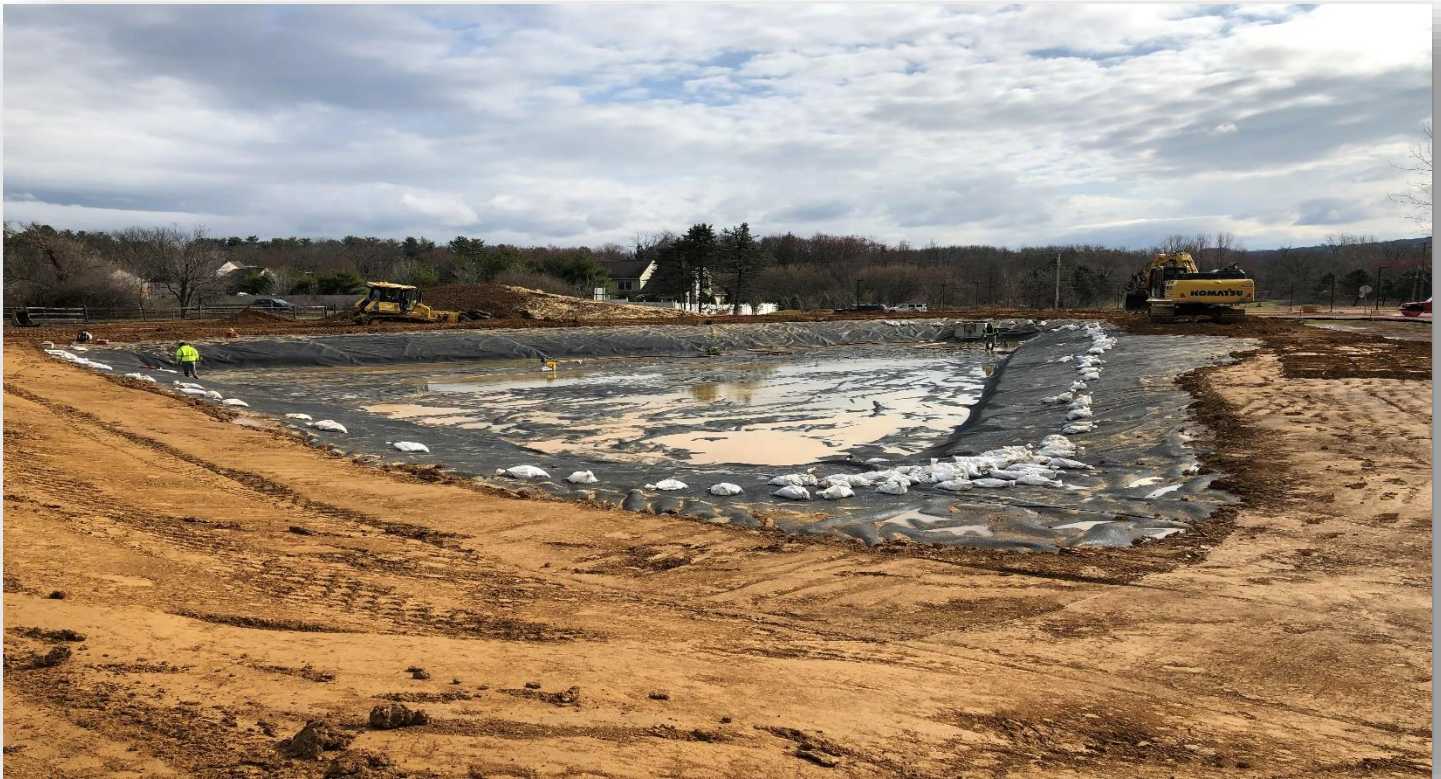
Figure 1 Lower Drainage Basin construction stage with liner installation. Additional stages to include rock, soil, perforated pipe and plantings in accordance with our approved NPDES permit.

Excavation, clearing and construction of the lower drainage basin is proceeding on schedule and without issue. The Lehigh County Conservation District has performed required technical plan reviews of our Erosion and Sediment Pollution Control (ESPC) plans along with conducting earth disturbance inspections. Our General Contractor, Athletic Fields of America (AFOA) continues to manage site safety while responding to township required inspections and all local code requirements.